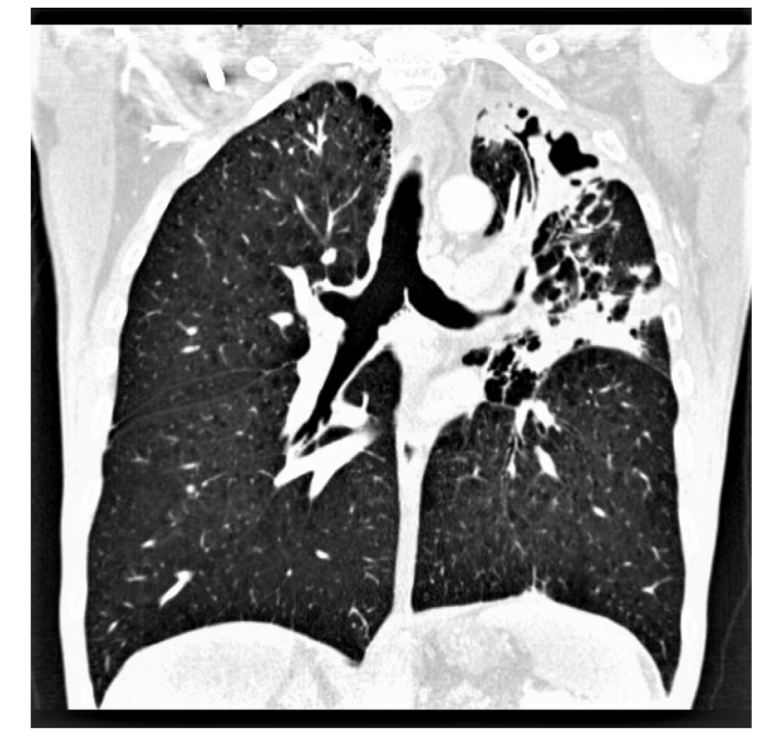
Fig. 1. Chest CT scan: The scan shows left apical cavitation with visible fungal balls and pericavitary fibrosis.

maximum impulse was at the 5th intercostal space left mid-clavicular line with an apical heave. His abdomen was mildly distended, with a positive shifting dullness and tender hepatomegaly of about 4 cm below the coastal margin. The rest of the examination was essentially normal.