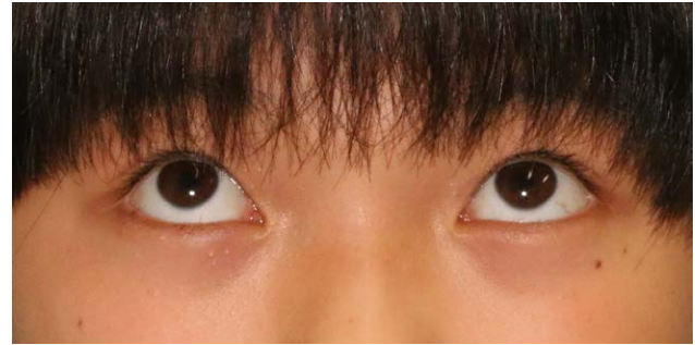
Fig. 4. Postoperative photograph of the patient. The left ocular motility disorder was improved at the 5-month postoperative follow-up examination.

nerve (a branch of the trigeminal nerve) was compressed due to an orbital floor fracture. Bradycardia and vomiting resulted from the subsequent OCR. OCR is often improved by removing the direct cause. Serious clinical signs include severe bradycardia and asystole, but few deaths have been reported. Anticholinergic drugs such as atropine are administered to treat severe bradycardia. Cardiopulmonary resuscitation is performed in response to asystole if there is no improvement when the direct cause is eliminated or anticholinergic drugs are administered. In this patient, forceps directly grasping the tissue containing the infraorbital nerve caused a severe OCR. Because the anesthesiologist immediately administered atropine to treat the asystole, cardiopulmonary resuscitation was not required.