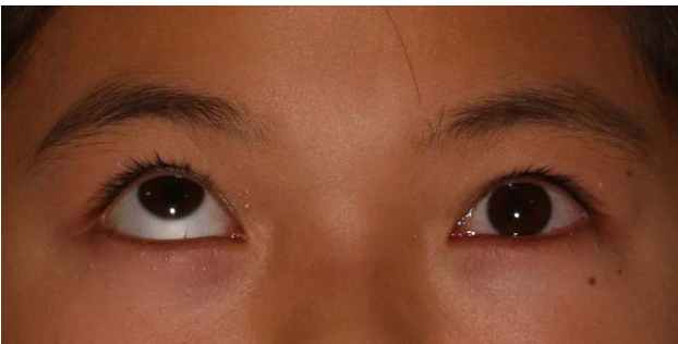
Fig. 2. Preoperative photograph of the patient. A left ocular motility disorder is present. No areas of subcutaneous or subconjunctival hemorrhage were found.