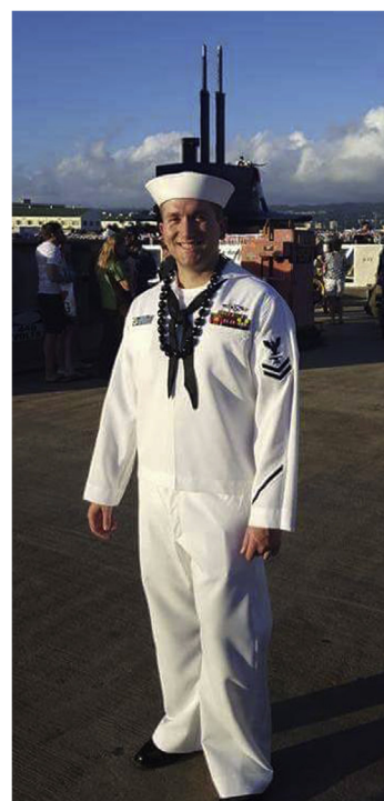
Fig. 3. Patient returning to active duty in US Navy following recovery from leptospirosis pulmonary hemorrhage syndrome.