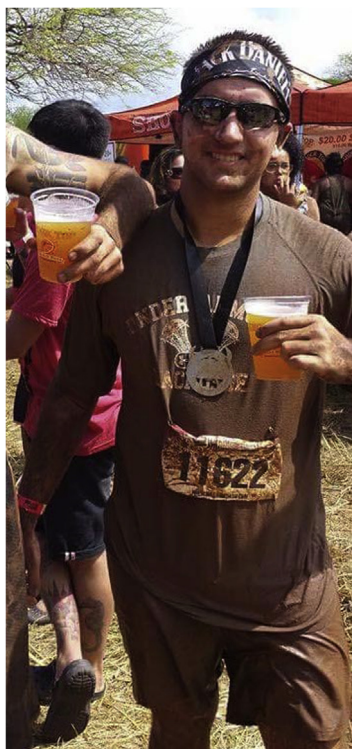
Fig. 2. Patient covered in mud following participation in mud-run in Hawaii.

Leptospirosis occurs in humans following contact of mucous membranes or abraded skin with the spirochete Leptospira interrogans , excreted in the urine of infected animals. Cases of leptospirosis can occur worldwide but are classically associated with tropical and subtropical regions [5]. Of the states in the USA, Hawaii has the highest endemicity [6] and was the initial clue to the diagnosis in this case. Exposure to contaminated water, soil, and other matter places several populations at risk– rural animal or vegetable farmers, slaughterhouse workers, flood victims, soldiers, and urban sanitation workers or children exposed to rat urine in garbage or alleyways. Based on the various presentations and patterns of exposure, the human form of this disease has gone by many names: Weil's syndrome, hemorrhagic jaundice, swineherd's disease, Fort Bragg fever, swamp fever, mud fever, autumn fever, field fever, rice-field fever, cane-cutter's fever, and canicola fever [5]. Improved sanitation and mechanization of agriculture decreased rates of this disease, with epidemic leptospirosis disappearing in the 1960s. Global climate change has now been implicated in its reemergence beyond classic geographic