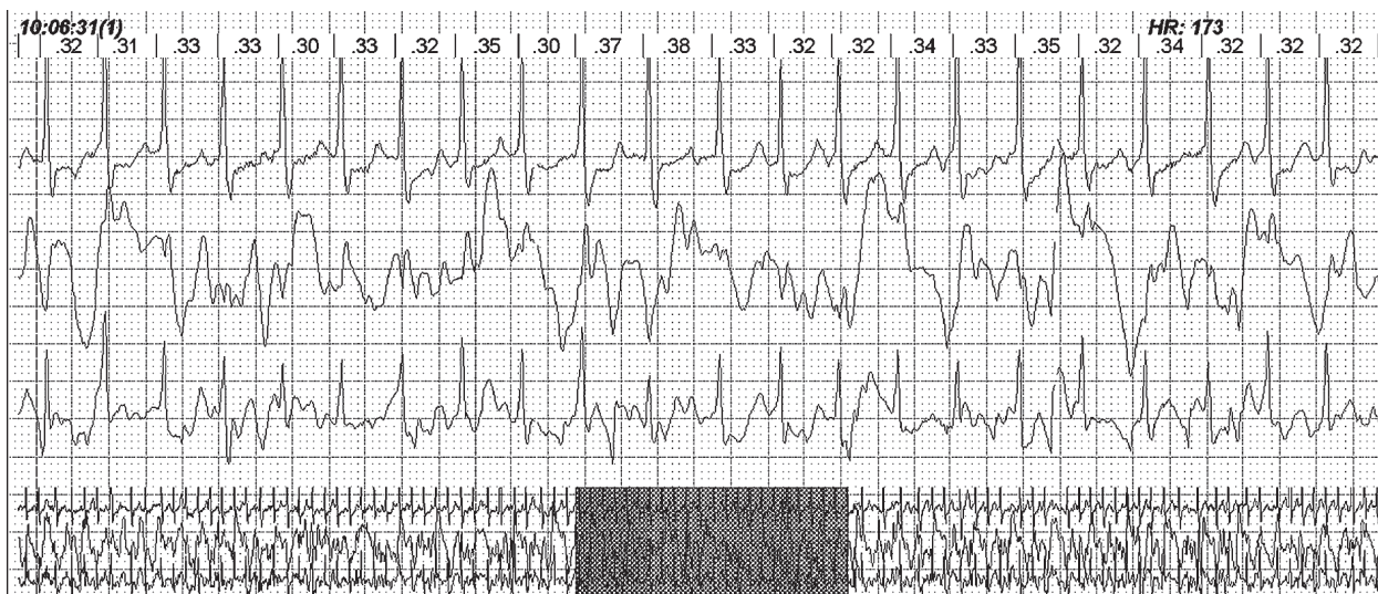
Figure 1. Holter ECG: atrial fibrillation with fast ventricular rate