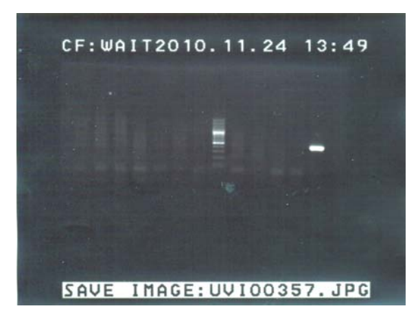
Figure 1.Gel electrophoresis PCR with low risk HPV. Line 1 is positive control (positive band is amplified by HPV DNA of 149 base pairs), line 2 is negative control, line 6 is weight marker (100 bp ladder). Other lines are negative samples.

A high number of HPV infection exists in tropical parts of world, therefore there is the possibility that continuous contact with sun ray reinforces HPV infection. Ultra violet light has many effects on dermis immunity including reducing the number of Langerhas cells in epidermis and decreasing their antigen production ability, increasing the production of IL-10 and prostaglandin E2 by keratonocytes, and increasing the serum level of IL-4 (11). It