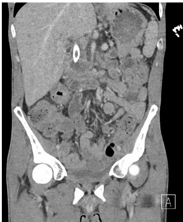
Figure 3 Coronal view from computed tomography scan of the abdomen after radiation therapy. Note pancolonic wall thickening with adjacent inflammatory changes compatible with an acute inflammatory colitis.

pathologic findings of marked acute colitis with epithelial denudation, prominent apoptotic bodies, crypt rupture granuloma, decreased goblet and Paneth cells, and patchy increased chronic inflammation. Workup for an infectious cause was negative (including Shigella , Escherichia coli , Campylobacter , Enterobacter histolytica , Salmonella , cytomegalovirus, and Epstein-Barr virus). However, CRT was discontinued with only 19 of the planned 25 fractions completed because of concern that CRT was the cause of the pancolitis.