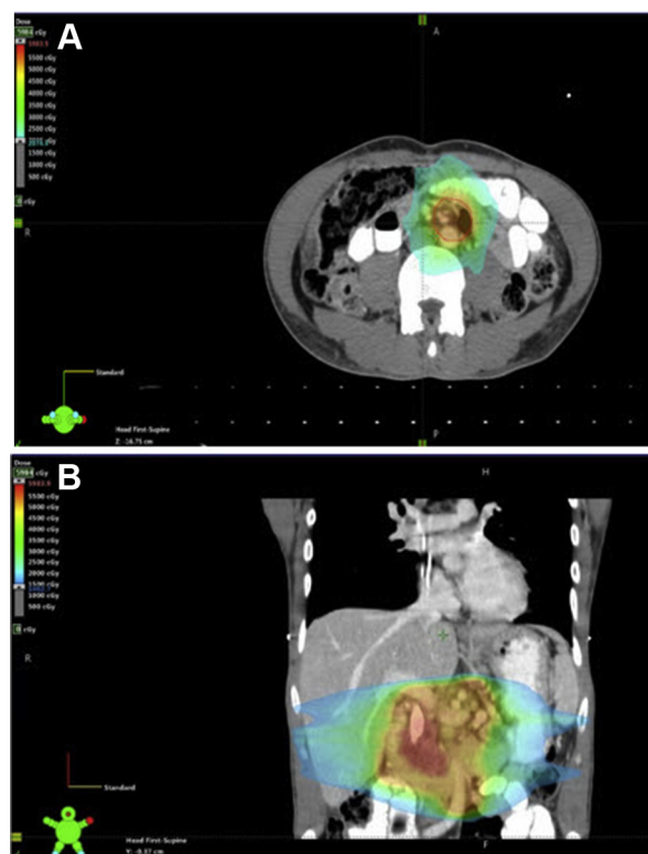
Figure 2 Radiation treatment plan (planned for a total dose of 55 Gy in 25 fractions with concurrent 5-fluorouracil). (A) Axial slice showing radiation dose overlapping the transverse colon. (B) Coronal image of radiation plan. Large areas of overlap between treatment planning target volume and large bowel.

The patient started 5-FU—based CRT with the plan for a total dose of 55 Gy in 25 fractions using a 6 MV volumetric modulated arc therapy plan (Fig 2). He received standard 5-FU 225 mg/m 2 per day for a planned 5 d/wk on days of radiation. His total bilirubin started trending down. However, about 1 week after starting therapy, he reported increasing diarrhea. Before starting therapy, he was having 6 to 8 bowel movements a day, which was attributed to pancreatic enzyme and bile salt insufficiency. After fraction 8 of radiation he reported a slight increase in bowel movements, with 8 to 10 bowel movements per day with a more watery consistency and