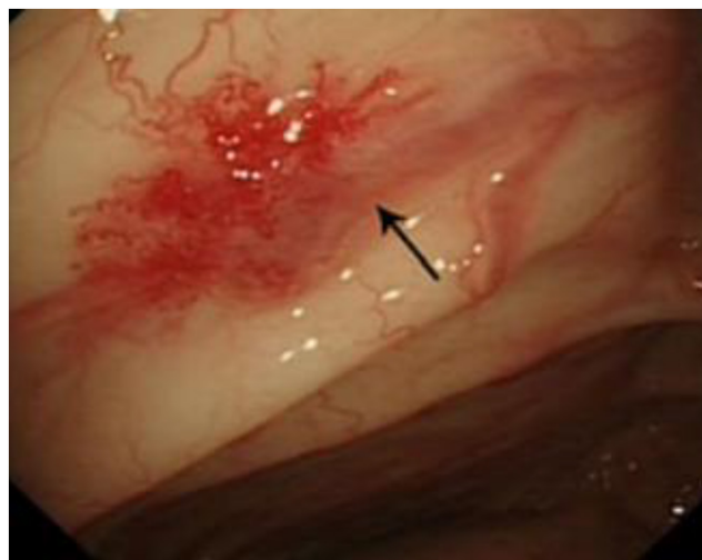
FIGURE 1 Angiodysplasia found in the mucosa of the ascending colon, during the April 2019 colonoscopy

Figure 2 presents a graphical depiction of the case timeline and the transfusions and endoscopies conducted and the hemoglobin response.