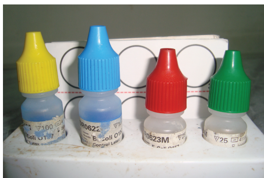
FIGURE 3: Agglutination kit (Oxoid) for diagnosis of E. coli O157:H7.