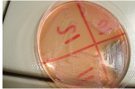
FIGURE 1: Sorbitol-nonfermented colonies of E. coli O157:H7 on CT-SMAC media.

2.4. Agglutination Test. Individual isolates colonies of nonsorbitol-fermenting colonies on CT-SMAC medium were tested for the presence of the O157 and the H7 antigens