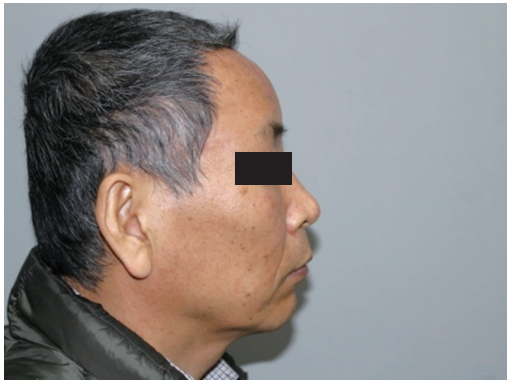
Fig. 3. Fat grafting was helpful for decreasing the visibility of the scar and contour irregularity.

fixation of the frontal sinus anterior wall, maintenance of sinus function preserving the continuity of nasofrontal duct drainage, and sinus obliteration (with a broad range of matters). Some complicated cases of frontal sinus fractures may require sinus cranialization; however, the benefit of cranialization was controversial [27]. Clinical and experimental evidence suggest that duct obstruction and/or remnant sinus mucosa due to inadequate obliteration are serious predisposing factors of infectious complications [28].