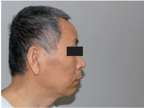
Fig. 2. In this patient with craniectomy and cranioplasty with Medpor, the right forehead has a conspicuous scar with depressed contour.