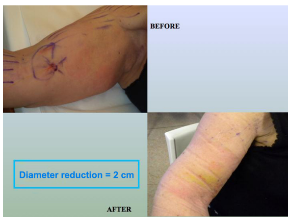
Figure 3 Two-cm reduction in right arm circumference after first treatment with Nd:YAG 1062 nm (15 W) endovenous laser.

used at the skin access site and the arm surface is regularly cooled. 11 Obviously, multiple longitudinal channel drilling cannot be considered a radical management procedure for lymphedema. Because it achieves autonomous active lymphatic drainage, regular daily mechanical or manual pressotherapy 9 is required to keep the channels open and prevent further fibrotic reactions and obstruction of continuous lymph flow into the newly formed lumen. In our experience, it is mandatory to prepare a functional area in the normal dermis cephalad to the lymphedematous tissue in order to distribute the drained lymphatic volume recovered by daily pressotherapy through these short (15–20 cm) newly formed channels. Even if this step may damage the normal lymphatic network in the adjacent area, 12 it is necessary in order to facilitate uptake of fluid into normal lymphatic vessels. In