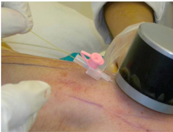
Figure 2 Introduction of a 21-gauge plastic venous catheter and subsequently of the fiber optic laser through an incision in the skin.

used at the skin access site and the arm surface is regularly cooled. 11 Obviously, multiple longitudinal channel drilling cannot be considered a radical management procedure for lymphedema. Because it achieves autonomous active lymphatic drainage, regular daily mechanical or manual pressotherapy 9 is required to keep the channels open and prevent further fibrotic reactions and obstruction of continuous lymph flow into the newly formed lumen. In our experience, it is mandatory to prepare a functional area in the normal dermis cephalad to the lymphedematous tissue in order to distribute the drained lymphatic volume recovered by daily pressotherapy through these short (15–20 cm) newly formed channels. Even if this step may damage the normal lymphatic network in the adjacent area, 12 it is necessary in order to facilitate uptake of fluid into normal lymphatic vessels. In