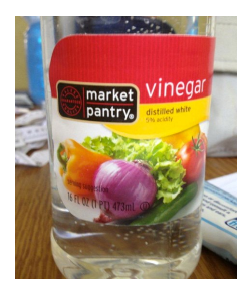
Figure 1. Inexpensive household vinegar used to perform the Visual Inspection with Acetic Acid (VIA) test.

from Emory University School of Medicine as part of a collaboration with the Haiti Medishare program. The patient had multiple complaints due to a lack of previous healthcare. We will focus this report mainly on her gynecological symptoms and the subsequent clinical examination that was performed, including the application of the VIA screening technique.