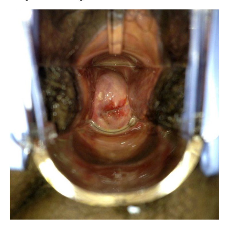
Figure 3. Visualization of cervix with acetic acid reveals white patches indicating cervical dysplasia.

Figure 2. Speculum exam revealed erythematous, swollen cervix with white discharge and notable vascular changes surrounding the os.