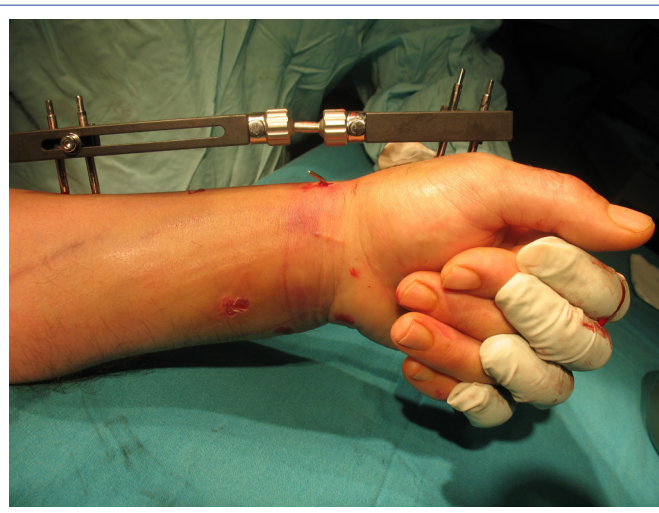
Figure 1. Postoperative evaluation of optimal reduction and distraction.

In the etiological evaluation, fractures occurred due to falling on the floor at home (n=5, 20%), on flat ground outside the home (n=9, 36%), and from height (n=6, 24%); traffic accidents (n=4, 16%); and direct trauma (n=1, 4%) (Table 1). Five (19.23%) patients had open fractures. According to the Gustilo–Anderson classification, fractures were classi-