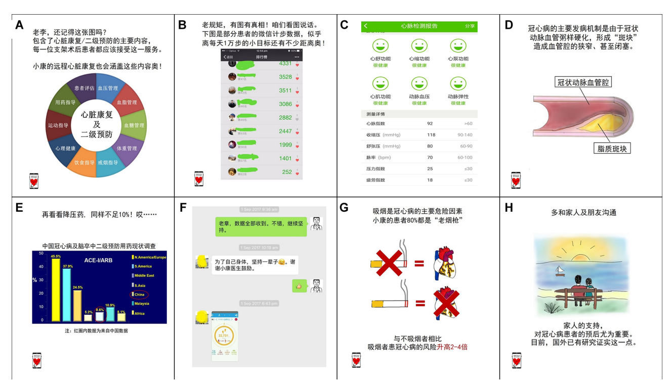
Figure 3 WeChat-based CR/SP system interface depicting health education (A), physical activity tracking (B), blood pressure monitoring (C), cholesterol management (D), medication management (E), individual counselling (F), smoking secession (G), mental health (H). CR/SP, cardiac rehabilitation and secondary prevention.

study's official WeChat account (Dr Kang). Replies will be made within one business day, and video calls will be booked if required by the participants.