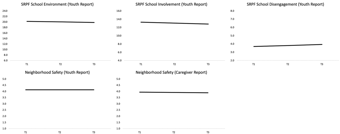
Fig. 2. Growth model trajectories for measures within the proximal social environment domain.