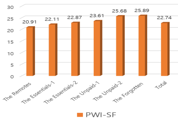
Figure 3. (PWI-SF, Psychosocial Well-being Index short form) Participants’ psychological health by our Korean-adapted version of the new classes of occupation owing the COVID-19 pandemic.