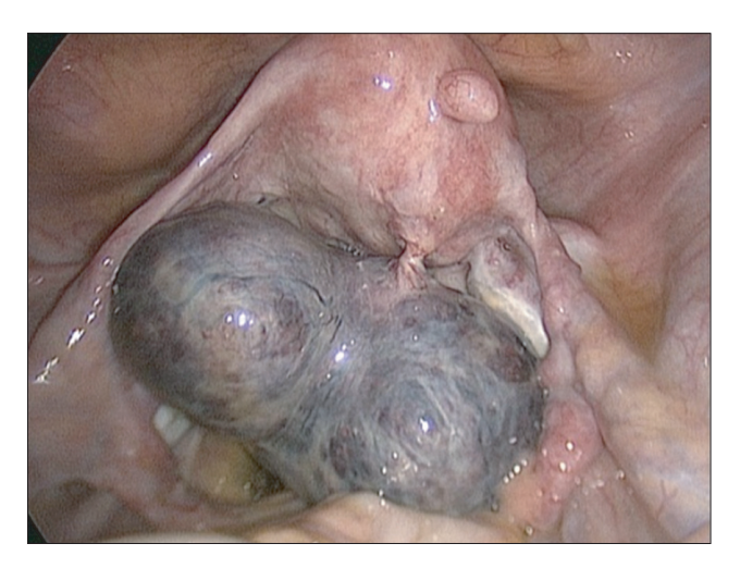
Fig. 3. A dark blue subserosal leiomyoma, approximately 8 cm in size, was identified on a twisted pedicle to the posterior surface of the uterus.

In general, when a patient with a leiomyoma experiences acute abdominal pain, the cause may be due to other organs rather than uterine leiomyoma; therefore, it is necessary to