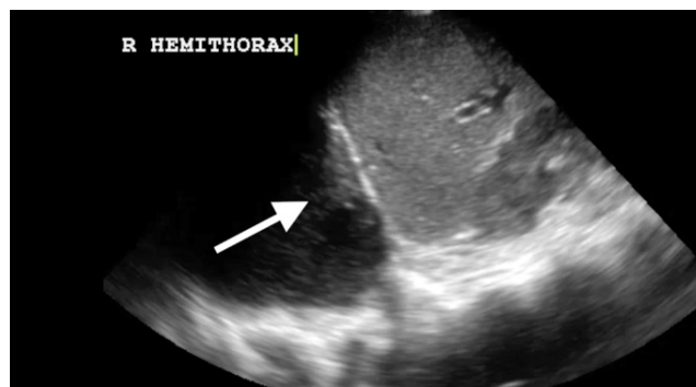
Image 2. Thoracic point-of-care ultrasound using 4-megahertz curvilinear probe, demonstrating an empyema in a coronal view (arrow). See video.