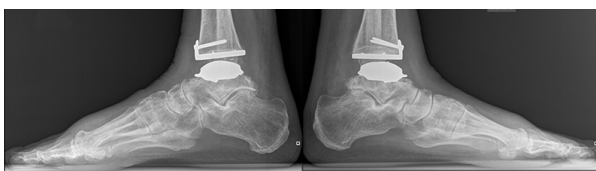
Figure 11 Lateral radiographs of both ankles 25 months after TAA. TAA centered correctly under the tibial axis.

Simultaneous bilateral TKA has been found significant more often associated with severe perioperative complications as myocardial infarction, pulmonary emboli or even mortality when compared to staged bilateral TKA in patients with co-morbidities and age over 70 years [4,8]. However, in healthy and younger candidates, like our patient, no elevated risk has been detected [8]. The