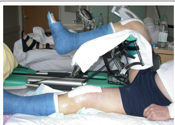
Figure 6 Clinical situation on third postoperative day. Knee flexed up to 90° with both ankles protected in rigid scotch-casts allowing full weight bearing.

set on subcutaneous enoxaparin 40 mg every day as thrombembolic prophylaxis. Postoperative monitoring was continued at the intensive care unit (ICU) for 24 hours. No intra- or perioperative complication occurred. The drains in knees and ankles delivered in total 1270 ml during 48 hours after surgery. Two units of blood were given at the second postoperative day and the patient was overlapped to phenprocoumon (warfarin like drug) aiming for an international normalized ratio (INR) between 2 and 3. Physical therapy was started at the first postoperative day with knee passive range of motion. At the second postoperative day wound dressings were exchanged and bilateral non-removable lower leg scotch-casts were adjusted to both ankles to allow full weight bearing with crutches (Figure 6). Normal