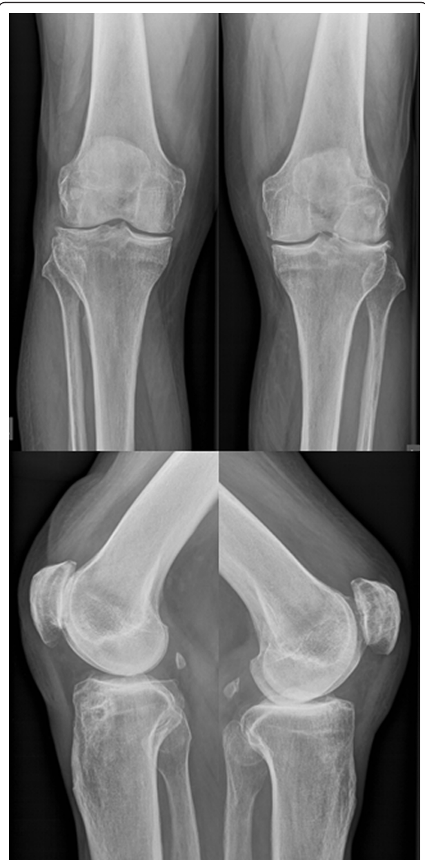
Figure 1 Preoperative radiographs of the knees. Tibiofemoral accentuated gonarthrosis at the left side.

The patient was educated in detail about non-surgical-, surgical joint salvage-, ankle fusion and TJA options and decided to have bilateral TKA and TAA as one surgical procedure. Surgery was performed with two surgical teams (surgeon [both authors], assistant, nurse, respectively) working at each leg, starting with the ankle on the left and the knee on the right side using a tourniquet on both sides (Figure 5). Cemented Triathlon cruciate retaining tri-compartmental TKA (Stryker,