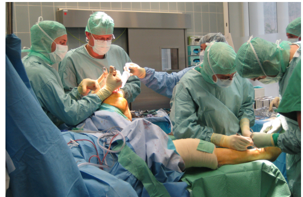
Figure 5 Surgical setup during quadruple total joint arthroplasty. Two surgical teams (surgeon, assistant, nurse) worked simultaneously on each leg. The picture shows the surgical setup at the time when the right TKA has been completed and one surgeon is implanting the TAA, while on the left leg the TAA has been completed and the other surgeon is implanting the TKA.

set on subcutaneous enoxaparin 40 mg every day as thrombembolic prophylaxis. Postoperative monitoring was continued at the intensive care unit (ICU) for 24 hours. No intra- or perioperative complication occurred. The drains in knees and ankles delivered in total 1270 ml during 48 hours after surgery. Two units of blood were given at the second postoperative day and the patient was overlapped to phenprocoumon (warfarin like drug) aiming for an international normalized ratio (INR) between 2 and 3. Physical therapy was started at the first postoperative day with knee passive range of motion. At the second postoperative day wound dressings were exchanged and bilateral non-removable lower leg scotch-casts were adjusted to both ankles to allow full weight bearing with crutches (Figure 6). Normal