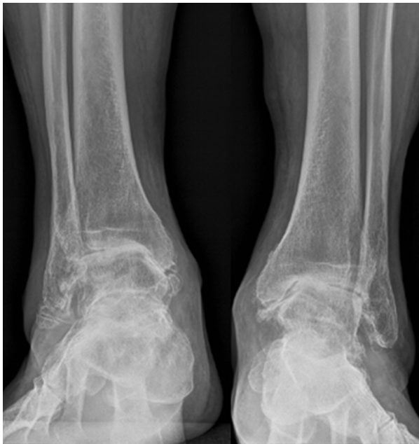
Figure 3 Preoperative anterior radiographs of the ankles. Advanced ankle osteoarthritis with severe varus malalignment on both sides

Kalamazoo, MI) via medial parapatellar approach and cementless Hintegra TAA (Integra, Plainsboro, NJ) were implanted in standard fashion, described elsewhere [13,14]. In addition, at the knees suction-drainage of the femoral canal before fluted alignment-rod insertion to decrease emboli, as well as lateral ligament repair on both ankles and a peroneus longus to brevis tendon transfer at the right ankle have been done for lateral ankle instability and right-sided peroneal dysbalance. Ankle instability became obvious after ankle osteophytes have been removed. Total surgical time from first incision to last closure was 2 hours and 29 minutes plus a total of 16 minutes for applying compression dressing at all joints. Intraoperatively, arterial pressure, pulmonary arterial pressure and pulmonary vascular resistance were observed by the anesthesiologists to abort the following TJA in case of sustained pathologic values. Perioperative intravenous cefuroxime was administered three times per 24 hours as antibiotic prophylaxis and the patient was