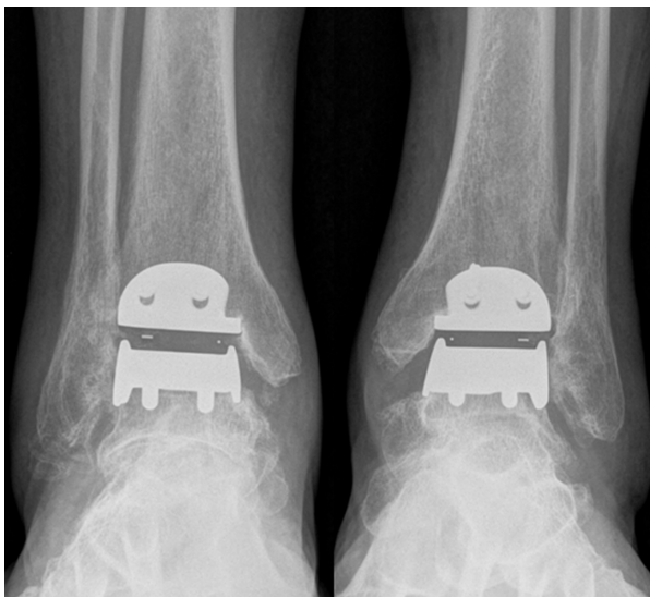
Figure 10 Anterior radiographs of both ankles 25 months after TAA. The picture shows bilateral TAAs with corrected varus alignment.

patient was able to flex to 150° with at most times “forgotten” TKAs. For the ankles outcome is less predictable. According to current reports, average outcomes have been reported as: combined dorsi-plantarflexion ROM of about 22.7°, AOFAS-score of 78.2 points, decreased but persistent mild pain, and an excellent result in only about 38% of cases [2]. Our patient had left ankle: no pain, ROM 55°, AOFAS-score 97; right ankle: mild intermittent pain, ROM 45°, AOFAS-score 81 points. This superior outcome after quadruple TJA may be caused in part by positive interaction of simultaneous replacements of all disabled joints as it has been described elsewhere [3,16,17]. However, in our special patient, we have to quote the strong commitment to gain independent walking ability and get back to work.