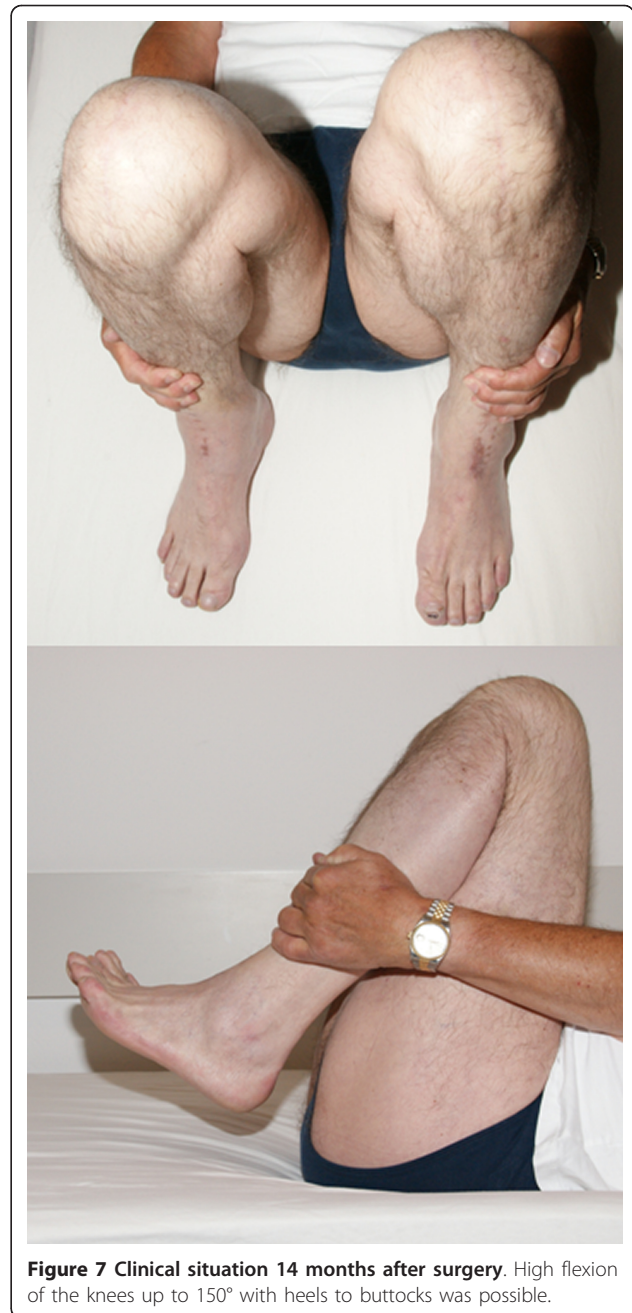
Figure 7 Clinical situation 14 months after surgery. High flexion of the knees up to 150° with heels to buttocks was possible.

At last follow-up, 25 months after surgery the patient presented with painless, stable knees which did not limit his work or recreational activities and symmetric knee extension/flexion 5-0-150° (Figure 7). Most time during the days the patient was not aware of having TKA ("forgotten TKA"). Both ankles were clinically stable; the left ankle was painless with dorsi-/plantarflexion ROM 15-0-40° and the right ankle mild painful (only after more than 30 min walking, VAS 3-4), ROM 15-0-30°. He was able to wear regular business shoes at work but favored regular hiking boots during recreation activities because of right-sided feeling of ankle instability walking on uneven ground. To class this individual outcome, the currently established American-Orthopaedic-Foot-and-Ankle-Society hindfoot score [15] was calculated (AOFAS-score: min. 0, max. 100 points: 40 points for pain, 50 for function, and 10 for alignment). The score increased at the right ankle from preoperative to last follow-up from 15 to 81 points, left ankle from 15 to 97 points.