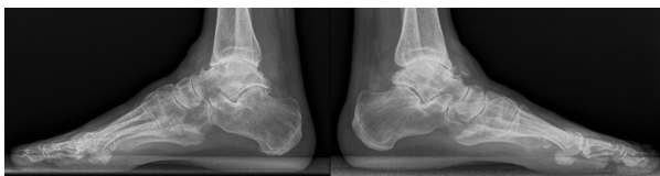
Figure 4 Preoperative lateral views of the ankles. Concentric end-stage ankle osteoarthritis on both sides.

Kalamazoo, MI) via medial parapatellar approach and cementless Hintegra TAA (Integra, Plainsboro, NJ) were implanted in standard fashion, described elsewhere [13,14]. In addition, at the knees suction-drainage of the femoral canal before fluted alignment-rod insertion to decrease emboli, as well as lateral ligament repair on both ankles and a peroneus longus to brevis tendon transfer at the right ankle have been done for lateral ankle instability and right-sided peroneal dysbalance. Ankle instability became obvious after ankle osteophytes have been removed. Total surgical time from first incision to last closure was 2 hours and 29 minutes plus a total of 16 minutes for applying compression dressing at all joints. Intraoperatively, arterial pressure, pulmonary arterial pressure and pulmonary vascular resistance were observed by the anesthesiologists to abort the following TJA in case of sustained pathologic values. Perioperative intravenous cefuroxime was administered three times per 24 hours as antibiotic prophylaxis and the patient was