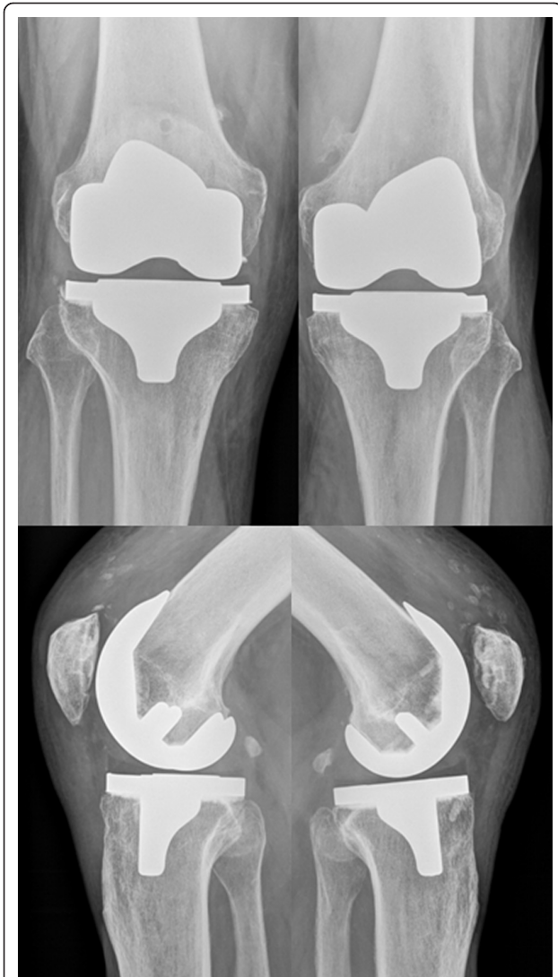
Figure 8 Radiographs ap and lateral of the knees 25 months after surgery. The picture shows correctly implanted bilateral TKAs.

This special case illustrates that simultaneous bilateral TKA and TAA as a quadruple procedure reduced disability without major complications. To our knowledge, there have been no previous reports of a simultaneous quadruple major TJA in the literature.