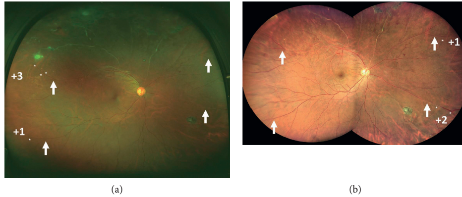
FIGURE 3: Fundus images obtained by the Optos and Clarus devices of a 42-year-old man with Coats’ disease that was evaluated by Rater 2. White arrows indicate the positions of the most peripheral branch identified on both devices. The asterisks indicate the branching positions more peripheral to the arrow in one device. In addition, the numbers indicate the branches identified beyond the most peripheral branch by the other device. In this case, three additional branches were identified in the upper temporal quadrant and an additional branch in the lower temporal quadrant in the Optos image than the Clarus image. In contrast, when compared with the Optos image, an additional branch was identified in the upper nasal quadrant and two additional branches in the lower nasal quadrant in the Clarus image. Therefore, the upper temporal and lower temporal quadrants were classified as “O > C” and the superior nasal and inferior nasal quadrants as “O < C” in this case by Rater 2.