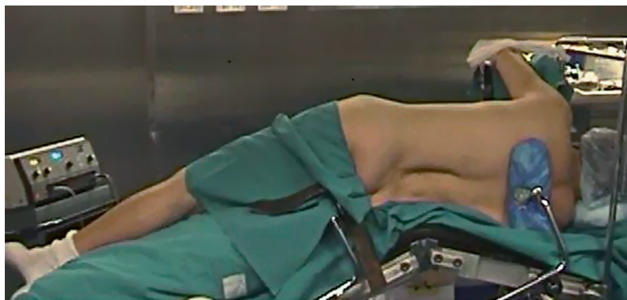
Figure 1 - Patient positioned.

Between September 2010 and December 2015, we performed 81 Retroperitoneoscopic RAPN (44 left and 37 right) (Table-1). Average size was 3cm (1-9cm). The nephrometry score of the tumors was calculated using R.E.N.A.L and PADUA scores (4). The exclusion criteria in the selection of patients for this type of surgery were: anterior masses of the lower pole, anterior masses of the hilum, previous retroperitoneal surgery, spinal abnormalities. Surgical technique: the patient is positioned on full flank position, the umbilicus on the break point of the of the table, the legs are positioned and a pillow is put in between (the internal leg is flexed at 45°, while the external leg is totally extended). The table broken until maximum skin extension reached in order to have as much working space as possible. The arm is positioned on an armrest secured close to the head as much as possible. The patient is secured by two supports placed behind: one on the upper part of the back at level of interscapular line and one on the lower part of the back at the level of sacrum bone. The patient is then further secured to the Table with Tensoplast® at shoulders level and at knee level (Figure-1). An oblique 1.5cm incision