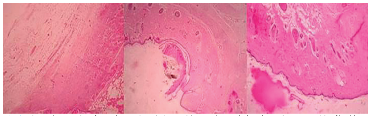
Fig. 3: Photomicrographs of samples on day 10 show widespread granulation tissue, interspersed by fibroblasts in control group (left). In FGF-1 (center) and FGF-2 (right) groups, moderate-to-high degrees of fibroblast proliferation are evident in support of wound healing acceleration.

The authors declare no conflict of interest.