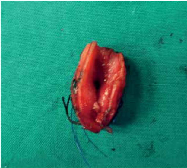
Fig 1 Resected tracheal section of the stenosed segment.