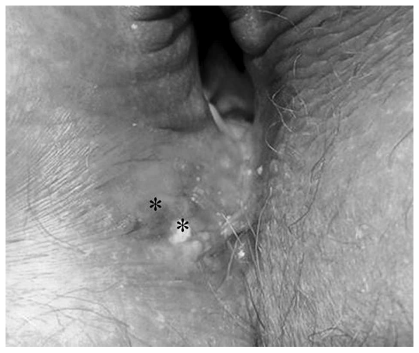
Figure 1. Two lesions located laterally to the right labia minora

The patient was advised to undergo local excision with bilateral inguinofemoral lymphadenectomy (Figures 2 A–C), which was performed 2 months after the primary diagnosis. On each side of the lesion, at