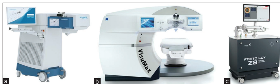
Figure 1: Three femtosecond laser (FS) platforms currently allow refractive corneal lenticule extraction (RCLE). The SCHWIND ATOS FS (a; SCHWIND eye-tech-solutions GmbH, Kleinostheim, Germany) received CE approval for its SmartSight application in July 2020 and the FEMTO LDV Z8 FS (c; Ziemer Ophthalmic Systems AG, Port, Switzerland) for its CLEAR program in April 2020. SMILE, available with the VisuMax FS (b; Carl Zeiss Meditec, Jena, Germany), is the only current RCLE application with CE and FDA approval. [25-27]

Following the introduction of the VisuMax FS [Carl Zeiss Meditec AG, Jena, Germany; Figure 1b], in 2007, intrastromal lenticule refractive correction was reintroduced, in a procedure called femtosecond lenticule extraction (FLEX). Sekundo et al. published the 6-month results of the first 10 fully seeing eyes treated in 2008 [8] and a larger series followed. [28] The procedure still included the creation of a hinged flap, under which the stromal lenticule was extracted, both cut by FS