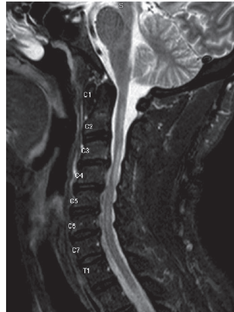
FIGURE 3: Hyperintense lesions representing demyelination from C2 to C6 on MRI C-Spine T2 FLAIR sequencing.

contrary, several studies have shown no significant increase or even decrease between time of first symptom onset and diagnosis between AA patients compared to CA patients [6, 7, 11, 14, 19]. In their retrospective study, Farber et al. found that race was not correlated to a higher number of ED visits or longer time to diagnosis, but faster time to diagnosis was associated with complaints of neurological symptoms. Given that a higher proportion of AA patients report neurological symptoms like sensory loss, paresthesia, vision problems, limb weakness, imbalance, and back pain, this could account for the equivalent and even shorter time periods to diagnosis found between AA and CA patients despite lower rates of access to healthcare in AA patients. These findings suggest that the difference in severity cannot