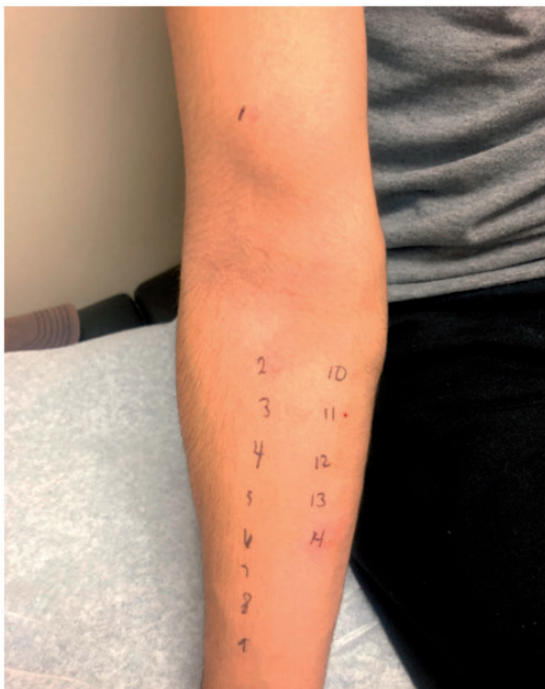
Figure 1. Patient's skin prick testing on right arm; Label 1: Jackfruit, 2: Latex, 13: negative control, 14: histamine.

SPT was conducted using canned jackfruit, latex, bananas, avocados, celery, potato, tomato, melon, peach, hazelnut, cherry, and apple. Jackfruit was positive with wheal of 3 mm and flare 5 \times 6 mm, latex was positive with a wheal of 4 mm and flare of 9 \times 13 mm, with a histamine of 8 mm and negative control of 0 mm (Figure 1). The patient was instructed to strictly avoid jackfruit and carry epinephrine for his jackfruit and latex allergy.