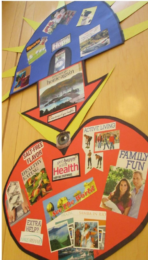
Figure 4. Crossing a bridge.

While participants reflected back to the time of their cancer diagnoses through the use of multiple panels, they