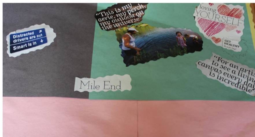
Figure 5. I was broken.

Thus, several participants’ collages captured the idea of a starting point or disruption, around the time of their cancer diagnoses. Participants used separate panels, as well as darker images, to depict the ways in which they reflected backward upon cancer experiences, while transitioning toward a discussion of present and future spaces in which they could create and maintain hope as they faced the challenges associated with chronic illness.