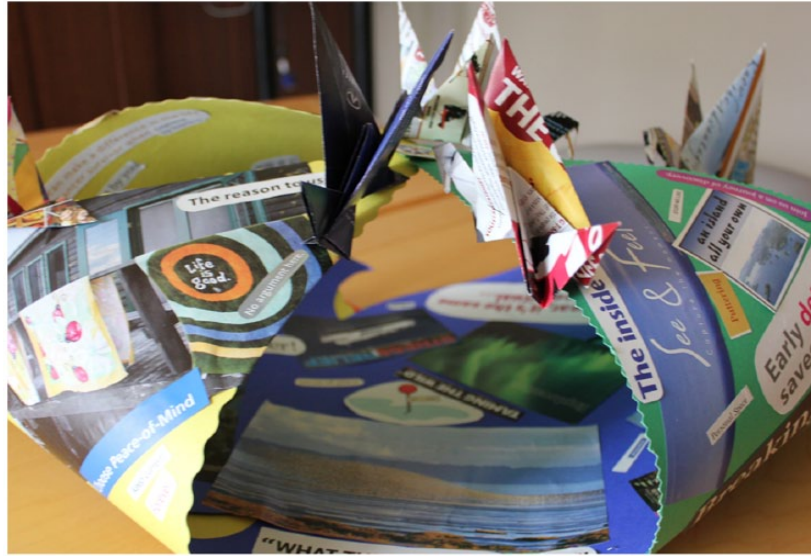
Figure 6. To hell in a handbasket.