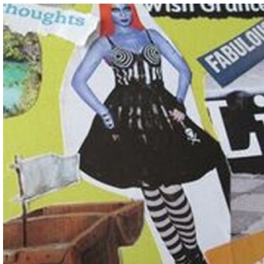
Figure 8. Stitched but victorious.

I've got sayings on dreaming. Pictures of your beach, 'find your beach.' A lot of things with birds. Also little, uh, little helpful sayings [laughs]. There's always hope, right? ... Every year for me in the summertime, the lymphedema is horrible, but that's alright, life is good, and sometimes the leg is swollen so [laughs] ... I don't know, but my collage has lots to do with birds and flying and spreading your wings and being in a good place.