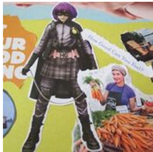
Figure 7. It will be okay.

I won! I've got the triumph, I've won, my 'wish' was 'granted.' This lady, if you look closely, she's got stitches everywhere. So she's like a rag doll that's put together, and some of them are around the breast. I thought, "Oh, this is good!" She's all mixed up and decked out and all dressed up and all fixed up and coloured up, you know, so she's victorious. So you know, life is fabulous and this was quite an experience. Through the pavement that I hit earlier, there's a flower that comes out and you know, life goes on.