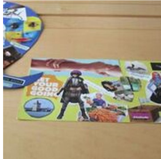
Figure 1. Respecting the process.

In contrast to most of the other participants, Claudette had some experience with collage (Figure 1):