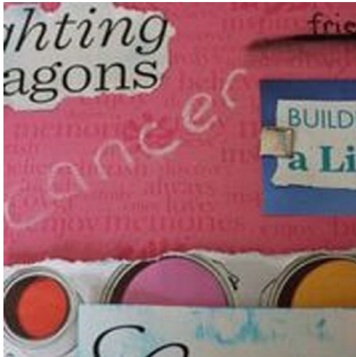
Figure 2. Words in white are background.

Nonetheless, there was also a general sense that pictures and the words/texts cut from magazines would not adequately express participants' experiences and reflections. Many of the participants added handwritten words to their collages. For example, Jennifer said that she wanted to direct attention to certain words (Figure 2):