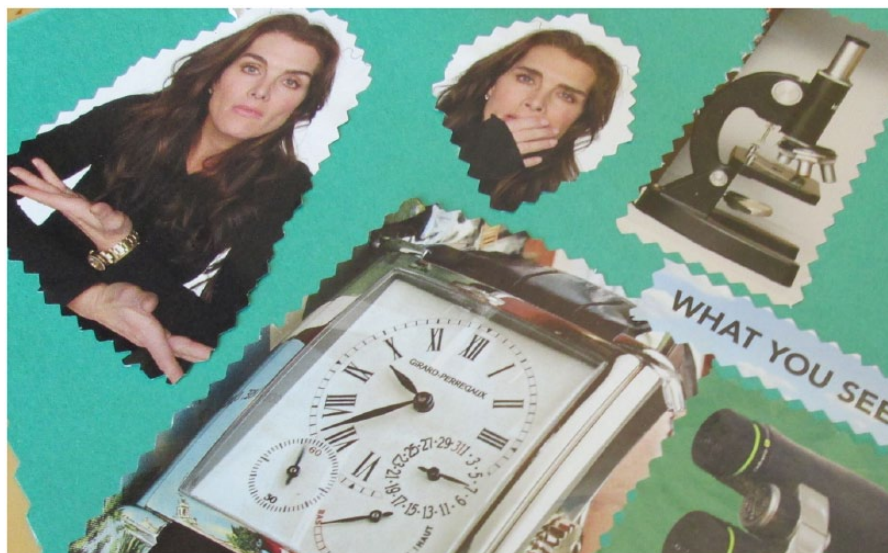
Figure 3. Under the microscope.

Well, no. I've seen worse working in a hospital where there's a lot of dramatic things. So you know, through all that. You start on your journey, you know. On the journey, there are these people in the desert. It's hard. It's a difficult environment, but you're going someplace. You're going on an adventure. You're in it and you're just moving ahead. So you learn more about stuff that I would never have learned about had I not had this. You know, it's a growth experience.