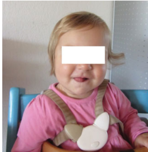
Fig. 3 Photograph taken 6 months after the operation. Straight hair is visible on the right side of the head. The right side of the head is affected by Horner's syndrome. The original hair texture of the infant is retained on the left side of the head.

At the age of 2.5 years, ultrasonic imaging showed several cysts measuring 3 mm that were localized close to her right thyroid lobe. Horner's syndrome had improved further but moderate ptosis of the right eyelid was still present. There was no impairment of her visual acuity. Her hair had normalized, and the hair texture was curly on both sides of her head. The tilting of the neck had subsided, and we noted no scoliosis. At this point, we stopped physiotherapy.