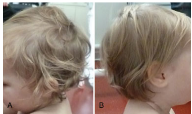
Fig. 4 Photograph taken at 16 months. (A) Straight hair on the right side of her head which is affected by Horner's syndrome. (B) The original hair texture of the infant is retained on the left side of the head which is not affected by Horner's syndrome.

The infant developed unilateral Horner's syndrome after subtotal excision of a large cervical lymphangioma of the neck. In addition to the usual symptoms, our patient experienced a