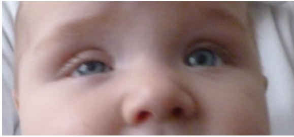
Fig. 2 Photograph taken 4 months after subtotal resection of the lymphangioma. Miosis and ptosis of the eye affected by Horner's syndrome. There is no heterochromia of the iris.

Postoperatively, we noted that the girl's right eyelid was positioned lower than her left eyelid, and her right palpebral fissure was smaller when compared with the left (→Fig. 2). We diagnosed Horner's syndrome and referred her to the ophthalmologists for diagnostic workup and treatment. Horner's syndrome was confirmed. The infant showed partial ptosis of her right eyelid, and the diameter of the right pupil was smaller when compared with the left eye, with preserved pupillary light reflex. In addition, we prescribed physiotherapy to improve the moderate limitation of active elevation and abduction of her right shoulder and arm and to correct the tilting of her neck.