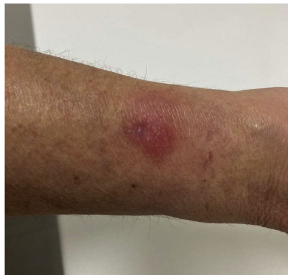
FIGURE 1. Well-defined erythematous patch on the left wrist 24 hours after the first dose of mRNA COVID-19 vaccine Comirnaty®-BioNTech/Pfizer.

After discussion, we decided to contraindicate the use of PEG in injectable forms and in colic preparations (for laxative use), considering the largest amount of PEG contained in these medications. Indeed, there are alternative treatments to colic preparations. The patient has never taken PEG for laxative use before. The benefit-risk balance is positive for the vaccine if a third dose is necessary, although it contains PEG. Cross-reactivity between PEG and polysorbate has been suggested in