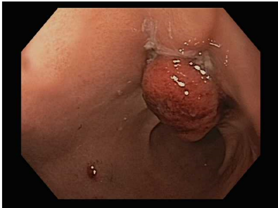
FIGURE 7: Endoscopic image of successful OTSC closure of perforation site