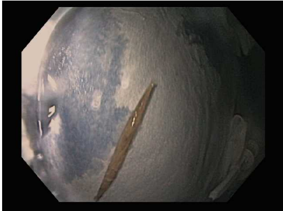
FIGURE 5: Full wooden toothpick removed from the patient