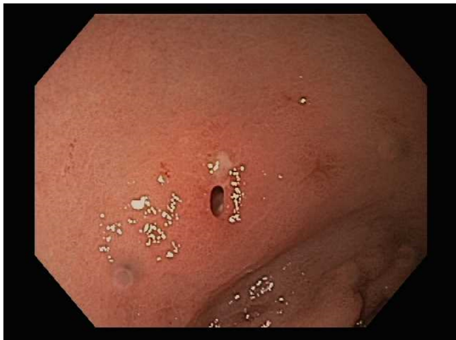
FIGURE 6: A 2 mm perforation site after removal of wooden toothpick