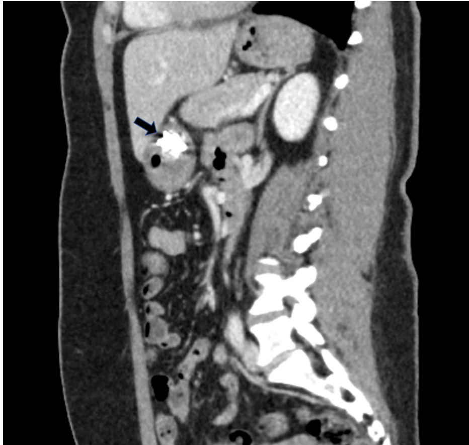
FIGURE 9: Abdominal CT scan revealing intact Padlock clip two years later