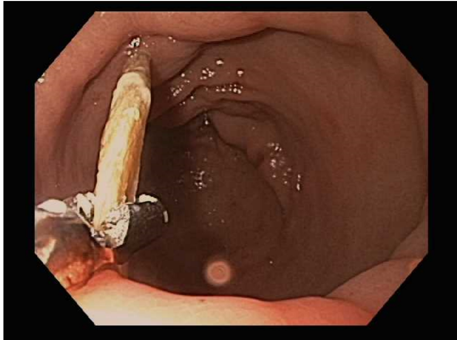
FIGURE 3: Endoscopic grasping of wooden toothpick with Raptor Grasping Device