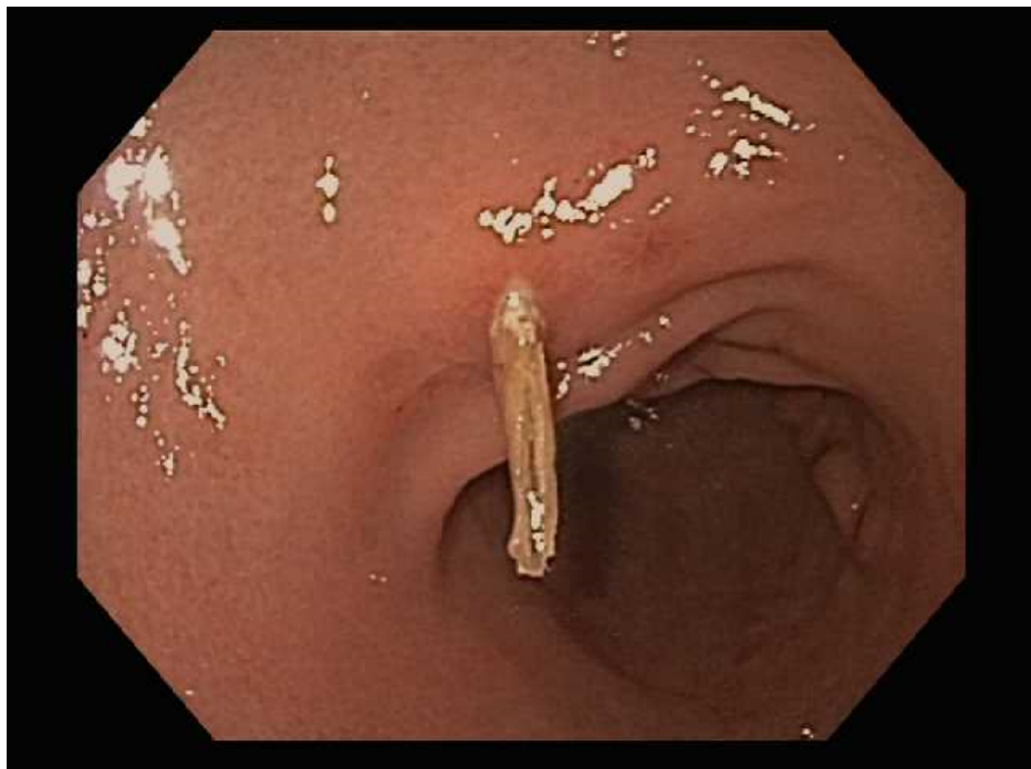
FIGURE 2: Endoscopy revealing wooden toothpick perforating the gastric antrum

Patient underwent an upper endoscopy revealing a toothpick in the gastric antrum perforating through the wall of the stomach (Figure 2). Endoscopic removal was successfully achieved using a Raptor Grasping Device (Steris, Mentor, OH, USA) with a foreign body hood protector (Figures 3, 4). Following removal of the toothpick, a full-thickness defect was found at the puncture site in the gastric antrum measuring 2 mm in diameter (Figures 5, 6). Endoscopic closure of the defect site was successfully achieved with an over-the-scope Padlock clip (Figure 7).