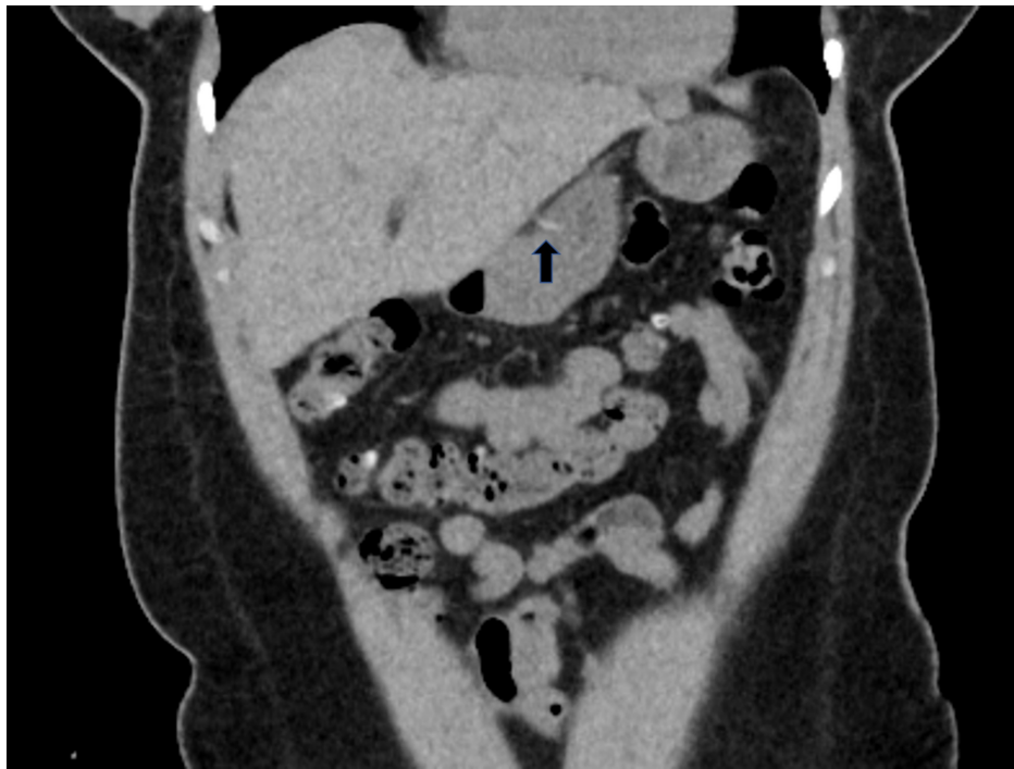
FIGURE 1: Abdominal CT scan revealing toothpick in distal body of stomach extending out of the lumen

Patient underwent an upper endoscopy revealing a toothpick in the gastric antrum perforating through the wall of the stomach (Figure 2). Endoscopic removal was successfully achieved using a Raptor Grasping Device (Steris, Mentor, OH, USA) with a foreign body hood protector (Figures 3, 4). Following removal of the toothpick, a full-thickness defect was found at the puncture site in the gastric antrum measuring 2 mm in diameter (Figures 5, 6). Endoscopic closure of the defect site was successfully achieved with an over-the-scope Padlock clip (Figure 7).