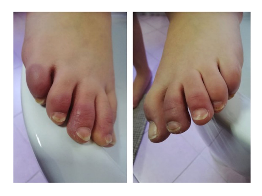
Figure 2 Acro-ischaemia presentation as finger toe cyanosis in a SARS-CoV-2 positive adolescent patient.

Several contingent criticisms can be signalled in the attempt to estimate skin involvement in COVID-19. Skin manifestations due to SARS-CoV-2 infection are often underestimated; since general conditions in most cases of hospitalized COVID-19 are critical, and dermatologic evaluation, skin biopsies or