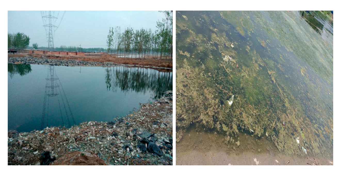
Figure 3. Water pollution in Hebei Province (taken in April 2018) and Fujian Province (taken in September 2019).

In addition, several individual demographic and social characteristics were also considered as control variables, including gender, age, education status, and Hukou status, which might be the important factors in affecting personal self-rated health. More explanations are provided below.