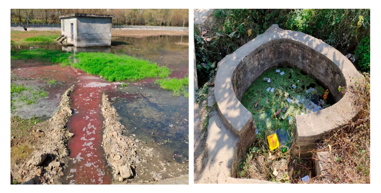
Figure 2. Perceived wastewater in the rural areas of Sichuan Province (taken in December 2018).

It is important to point out that according to former studies on perception of risk, as well as perception of environmental risk [15–19], with the participants being lay people and non-professionals, their judgements on the potential (environmental) risk may show great variability. However, the decision-makers could use the public's either factually correct or biased perception to implement optional and targeted actions. During the surveys, the majority of participants reporting witnessing the wastewater discharge, and water contamination by garbage. They tended to judge water quality by smell, color, and visible pollutant. Therefore, as lay persons, they may not tell exactly right judgements in distinguishing the type of wastewater, as well as specific water quality. However, as has been argued in existing literature, the policymakers should see the outcomes as an important reference in environmental policy implantations [12–15]. Figures 2 and 3 show the typically perceived wastewater and water pollution in the surveys.