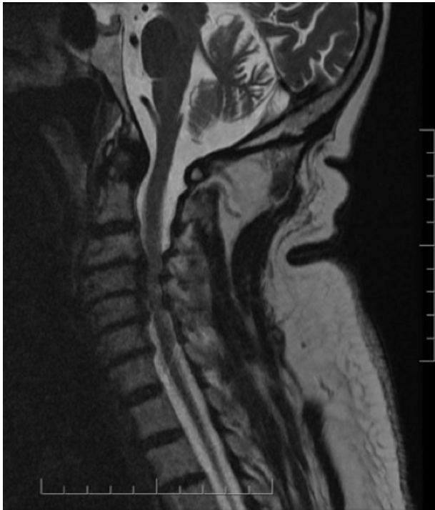
Figure 1 Typical MRI scan from patient with degenerative cervical myelopathy showing spinal cord compression and multilevel degenerative changes.

evaluation of undergraduate and postgraduate medical curricula identified deficiencies in DCM representation, however, collectively this did not correlate with student performance in multiple-choice question banks. 8