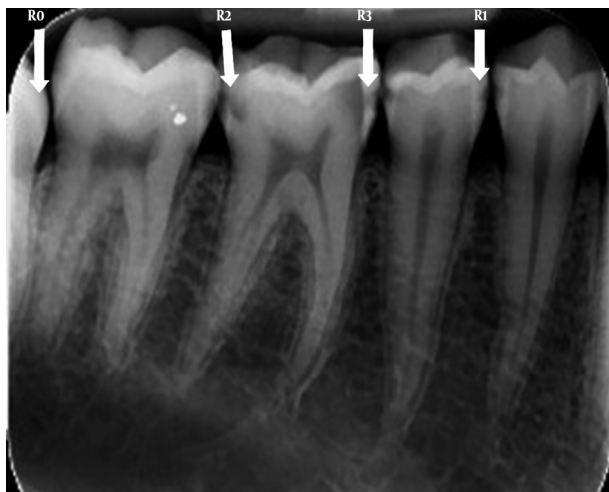
Figure 2. Classification of caries according to the depth of caries in radiography. Sound (R0), restricted to the enamel (R1), reaching the dentino-enamel junction, reaching the outer half of the dentin (R2) and the inner half of the dentin (R3)

Moreover, CCD Dixi3 was applied in the present study with a spatial resolution rate more than Dixi2 (16 lp/mm);