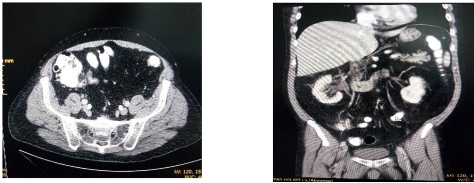
Fig. 1,2. Abdominal computed tomography demonstrating enlarged appendix in diameter and periappendiceal free fluid..