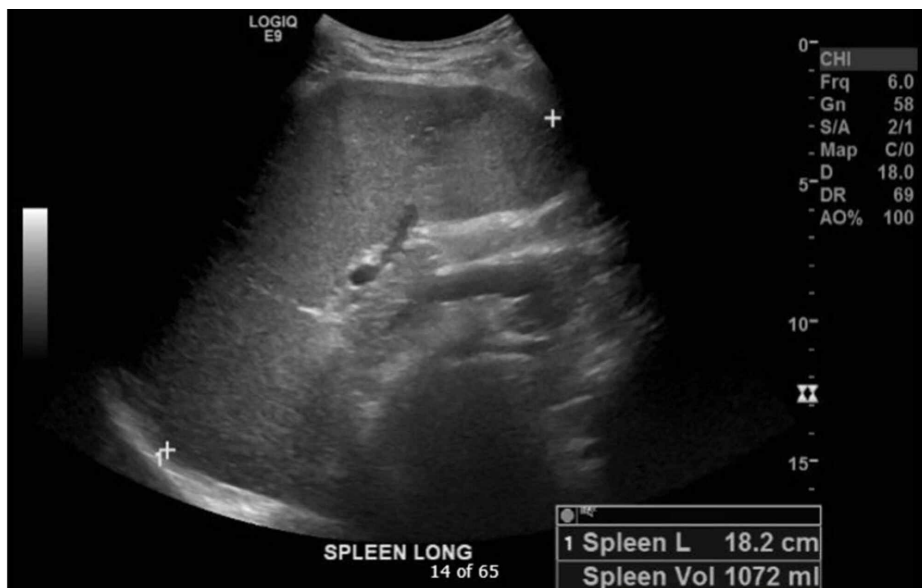
FIGURE 1: Splenomegaly indicated by spleen length at 18.2 cm with a splenic volume of 1,072 mL

The general impression of this man was a healthy-appearing young adult in mild to moderate abdominal discomfort with no worrisome signs, symptoms, or past medical history. The patient expressed minimal concern for his symptoms; however, his girlfriend insisted that the abdominal pain was abnormal for him. Besides, point-of-care ultrasound (POCUS) was utilized to exclude the presence of free fluid in the abdomen that might suggest a more serious cause of abdominal pain in the left upper quadrant. Unexpectedly, and beyond the scope of limited POCUS, splenomegaly (Figure 1) with areas of hypoechoogenicity indicative of splenic infarcts (Figure 2) was appreciated by the emergency provider, which prompted further investigation.