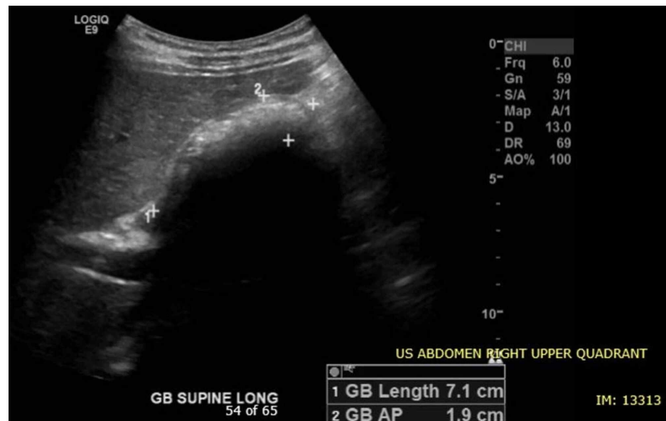
FIGURE 3: Gallbladder with multiple gallstones

A comprehensive radiology study was ordered, which confirmed the POCUS findings of pronounced splenomegaly with multifocal splenic infarcts, as well as uncomplicated cholelithiasis (Figure 3).