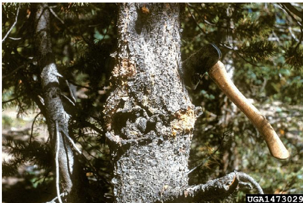
Figure 3: Stem canker caused by Cronartium harknessii on lodgepole pine ( Pinus contorta ). Photo by Rocky Mountain Research Station, USDA, Forest Service, Bugwood.org. Available online: https://www.forestryimages.org/browse/detail.cfm?imgnum=1473029