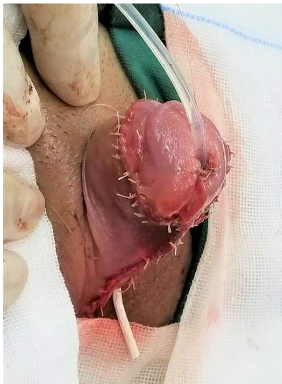
Fig. 4 The skin incision was sutured

body, 84 cases of a urinary meatus in the penile scrotum junction, and 21 cases of a urinary meatus in the perineum. The median operation time was 2.8 h (2.3 h - 3.9 h), the median length of postoperative hospital stay was 15 d (12 d - 29 d), and the median follow-up time was 5.2 years (3 months - 10 years). A total of 92 (59.3%) postoperative complications occurred, and 41 (26.5%) patients underwent reoperation. There were 49 patients (31.6%) with urinary fistula; among them, 7 healed by themselves, and 42 were cured after reoperation. Urethral stricture occurred in 26 cases (16.8%), of which 22 patients were cured after urethral dilatation, and 4 patients were cured after reoperation. There were 9 patients (5.8%) with urethral diverticulum after operation, all of whom were cured after reoperation. There were 8 patients (5.2%) with urinary tract infection, all of whom were cured by medical treatment. There were no cases of chordee recurrence or infravesical obstruction after surgery (Table 1).