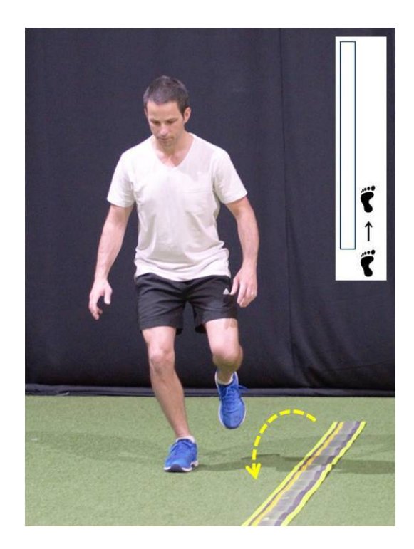
Figure 1: The Single Hop for Distance (SHD) Test, whereby the patient had to hop off one leg as far as possible, landing in a controlled manner on the same limb.

For the MHD (Figure 5) and LHD (Figure 6), patients were instructed to hop sideways in a medial or lateral direction, respectively, as far as possible. The hop was again considered successful if the patient landed in a controlled manner, though with the foot landing parallel to its starting position. For the SLCMJ, patients were asked to hop off one leg as high as possible (Figure 7). In order to assess jump height, the SLCMJ test employed an accelerometer (Myotester, Myotest S.A., Sion, Switzerland) which was fixed firmly around the waist using a Velcro strap, immediately superior to the greater trochanter. <sup>18</sup> Finally, the TSHT required the patient to hop throughout a 16-hop agility course (that included forwards, backwards and sideways di-