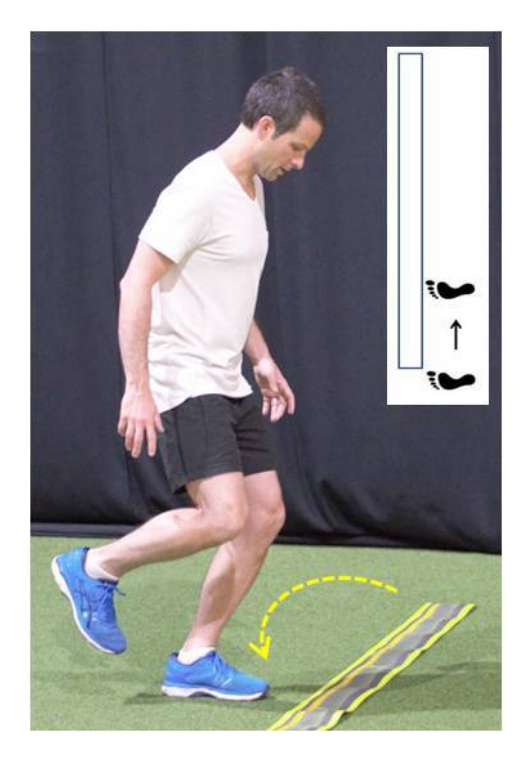
Figure 5: The Single Medial Hop for Distance (MHD) Test, whereby the patient had to hop off one leg in a medial direction as far as possible, landing in a controlled manner on the same limb.

Furthermore, it should be acknowledged that despite their widespread use, many of these single limb hop tests are straight line movements (apart from the TCHD which