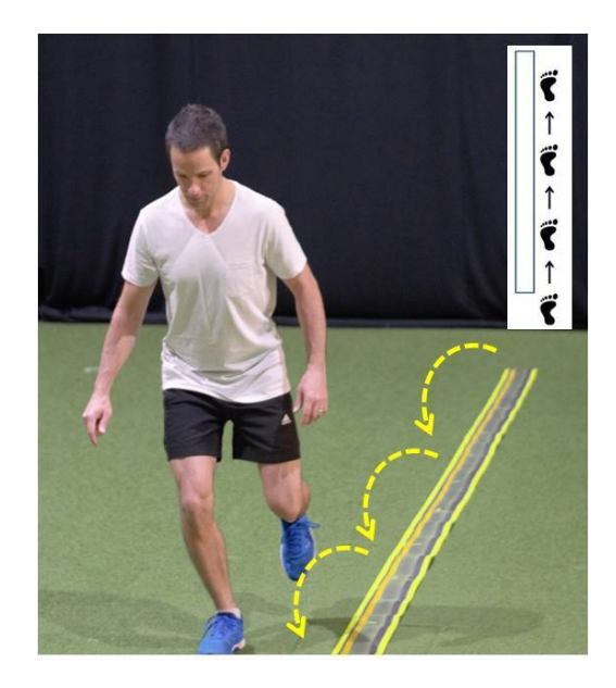
Figure 3: The Triple Hop for Distance (THD) Test, whereby the patient had to undertake three consecutive hops in a forwards direction, landing in a controlled manner on the third hop.

<u>Table 1</u> shows the mean (SD) LSI and range for each of the eight hop tests undertaken, for the entire cohort as well as specifically for males and females. For the entire