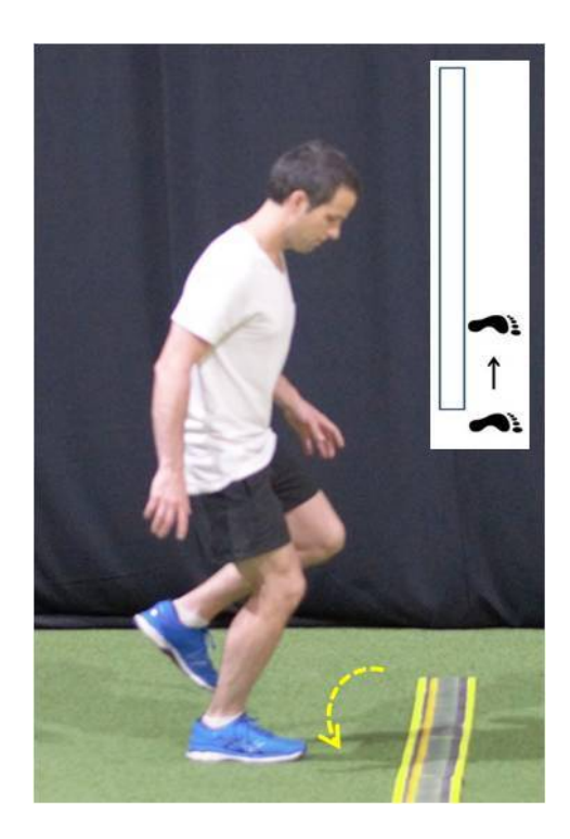
Figure 6: The Single Lateral hop for Distance (LHD) Test, whereby the patient had to hop off one leg in a lateral direction as far as possible, landing in a controlled manner on the same limb.

It is important to note that the current study employed a range of hop measures commonly reported in the literature and/or used routinely through our clinical institution. However, a range of other hop tests have been reported in addition to those employed in the current study including, though not limited to, the triple medial hop for distance, <sup>24</sup> the 90° medial rotation hop for distance, <sup>24</sup> the single timed lateral hop<sup>25</sup> and 30s side hop test, <sup>15</sup> the timed