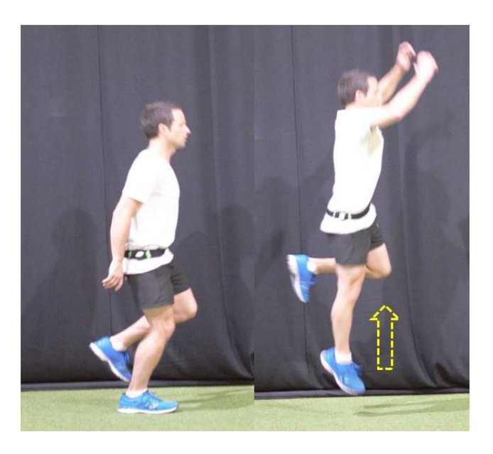
Figure 7: The Single Leg Countermovement Jump (SLCMJ) for Height, whereby the patient had to hop off one leg as high as possible, landing in a controlled manner on the same limb.

square hop,<sup>15</sup> the figure-of-eight timed hop test,<sup>26</sup> and a drop jump followed by a double hop for distance.<sup>15</sup> While we sought to manage the role of fatigue via hop test randomisation and providing patients the rest time they felt they required, incorporating more hop tests may have jeop-