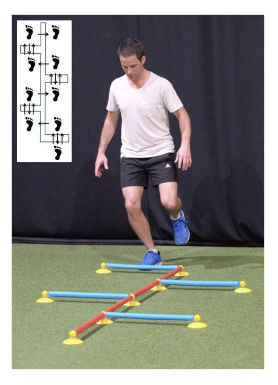
Figure 8: The Timed Speedy Hop Test (TSHT), whereby the patient had to hop on one limb as fast as possible throughout the 16-hop course that included forwards, backwards and sideways hops.

Fourthly, it should be acknowledged that the patients recruited for this study received varied rehabilitation guidance and exercise prescription, which could affect each patient's ability to undertake each of the varied hop measures. Furthermore, for the current study there were no specific objective criteria employed to essentially 'clear' the patient