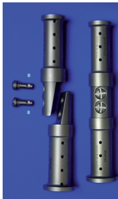
Figure 1. The custom-made interposition device consisting of 2 coupling parts. The 2 parts are fixed using 2 screws.

women) (Figure 2) using a custom-made interposition device (Waldemar Link GmbH, Hamburg, Germany) (Figure 1). Mean age was 74 (59–86) years. The fractures occurred mean 18 (13–28) years after primary THA and mean 14 (10–17) years after primary TKA. At the latest follow-up, after mean 8 (0.5–16) years, revision surgery with a total femur replacement was required in 1 case due to aseptic loosening. No other complications requiring revision surgery occurred.