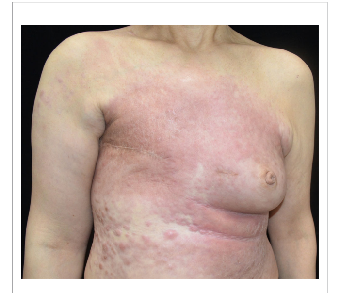
FIGURE 1 | Clinical picture of the patient. Elevated, keloid-like, fine nodules coalescing into diffuse sclerodermoid plaques in a background of erythema were found on the right upper arm, chest wall, and abdomen.

basis of her previous history of radiotherapy as well as the current clinical presentation, a diagnosis of postirradiation morphea was firstly considered.