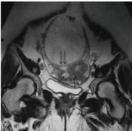
FIGURE 2: The wall of the gestational sac (double arrows) separates its contents from the uterine lumen (arrow).

sac then padding of the residual myometrial cavity were performed. Trophoblastic tissue was removed easily, and we did not need to perform any myometrial resection or subtotal hysterectomy. She had a satisfactory recovery.