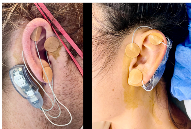
Figure 2 A percutaneous auricular nerve stimulation system (NSS-2 Bridge, Masimo, Irvine, California, USA). The pulse generator is adhered directly to the patient behind the ear over the mastoid process. Leads are placed (1) at the most cephalad portion of the antihelix; (2) immediately cephalo-anterior to the incisura and posterior to the superficial temporal arterial pulse; and (3) on the posterior ear opposite the antihelix at the level of the incisura. The ground electrode is inserted on the anterior side of the lobule (ear lobe). Used with permission from BA.

The pulse generator was applied posterior and slightly caudad to the preferred ear (contralateral to the side on which the patient slept) with a double-sided adhesive pad which was further secured with a clear adhesive dressing. Each of three electrodes and a ground has a 2 mm long integrated needle(s) (figure 1) and is affixed with a small, round adhesive bandage (figure 2). 16 Specific lead locations on the outer ear were guided with transillumination to optimize effects and avoid placement