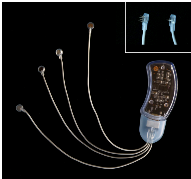
Figure 1 A percutaneous auricular nerve stimulation system (NSS-2 Bridge, Masimo, Irvine, California, USA). Each of the three electrodes has a 2 mm long integrated needle/lead (inset) and the ground electrode has four 2 mm long integrated needles/leads (inset).

suggest that this device may also provide analgesia in hospitalized patients following abdominal and pelvic surgery. 13–15 Similarly, the technique was reported in two cases to treat pain following total hip and knee arthroplasty. 16 The device is small, disposable, medication-free, non-surgical, battery-powered, and adhered directly to the skin behind the ear; relatively simple to apply, requiring no additional equipment or advanced training; has few contraindications; lacks systemic side effects and associated serious adverse events; has no potential for misuse, dependence, or diversion; and is a fraction of the cost relative to currently-available ultrasound-guided percutaneous neuromodulation devices. 16