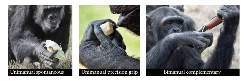
FIGURE 1: Different tasks performed by some of the chimpanzees at Fundació Mona (Girona, Spain): unimanual spontaneous task, unimanual with precision grip (simple reaching), and bimanual complementary task (hose task) with tool use.

unimanual actions, and bimanual complementary tasks are the least common. These authors also concluded that bimanual actions seem to be more indicative of hand laterality than unimanual actions.