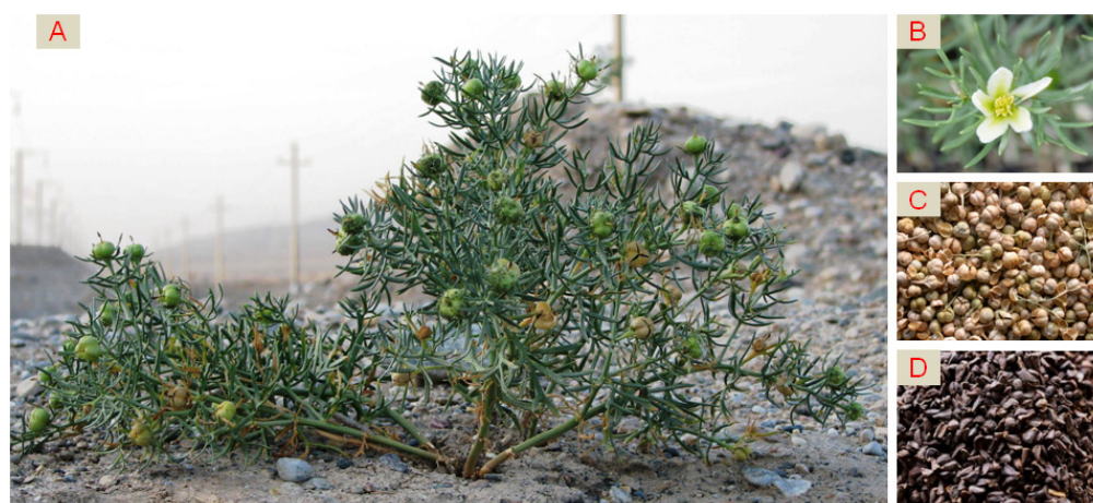
Figure 1. P. harmala (A) plant; (B) flower; (C) ripe fruits; (D) seeds.

P. harmala , is also known as “smelly ancient flower” in the Xinjiang Uyghur Autonomous Region, China; it is a glabrous perennial herb plant that is 30–70 cm high. It has numerous roots that are up to 2 cm thick and stems that are erect or spreading with numerous branched from the base. Its leaves are alternate, ovate, and divided into 3–5 lanceolate-striate lobes that are 1–3.5 cm long and 1.5–3 mm wide [15]. The morphology of P. harmala is shown in Figure 1.