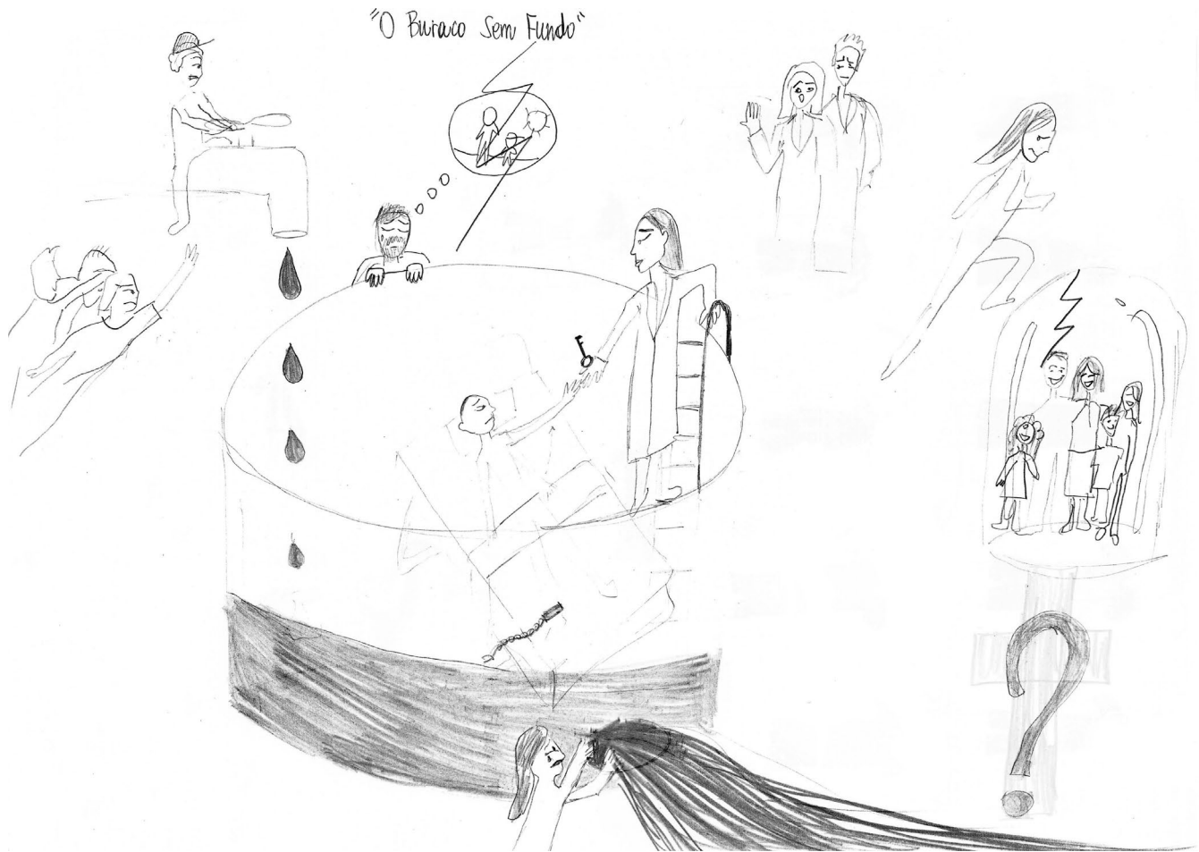
FIGURE 1 'The Bottomless Hole' (Rich Picture 2—RP2/State University of Campinas, 2017-2018): The student (Rose—fictitious name) depicts the experience of caring for an 18-year-old man (Luca—fictitious name) with end-stage cancer. Luca was admitted to the hospital, and Rose was responsible for evaluating him every morning and discussing his case with the multiprofessional team. Rose was very critical about the therapeutic plan mainly because it included procedures perceived as futile, such as daily blood transfusions (represented by the tap with blood drops on the drawing). Rose was also uncomfortable with the team's decision of not disclosing to Luca the terminality of his condition. After two weeks of clinical deterioration, Rose decided 'to tell the truth' (in her words) to Luca—a decision that is represented on the drawing by Rose giving him a key. By being honest with Luca, Rose felt she was disobeying a direct order from her supervisors. The following day, Luca died. Rose felt a mix of pride and guilt—both related to her finding the courage to be honest; both still present in the day she made the drawing, although the situation had happened two years before the interview. The title of the picture ('The Bottomless Hole') refers to the futility of transfusing blood to a terminal patient that has uncontrollable bleeding. At the bottom of the drawing, the female character trying to close the hole that is leaking blood is the mother of the patient. At the top right, the boy trying to close the tap is another patient who needs blood to survive and has a better prognosis

The first dimension happens in the psychological realm of students and refers to their struggle to prioritise, balance and apply conflicting moral values in the context of real clinical interactions. Students need to make choices; choices that always lead to some degree of perceived loss. In this process of developing a hierarchy of values and making a choice, students realise that moral decisions are often imperfect. This imperfection brings to light the conflict between students' idealised view of medical practice and the reality of clinical work. This first dimension is the most complex, and different internal conflicts can coexist in the same moral dilemma (Table 1). [Correction added on 12 February 2021, after initial publication on 15 December 2020; the displayed quote in the section entitled "Moral dilemmas are complex and multidimensional" was initially omitted due to a production error and has been reinstated.]