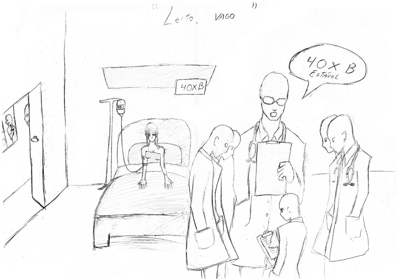
FIGURE 4 'Vacant Bed' (Rich Picture 4—RP4/ State University of Campinas, 2017-2018): The student (Carlos—fictitious name) drew the story of a patient (Suzanne—fictitious name) who was hospitalised because of abdominal trauma after being assaulted by her husband. It was the fourth time she had been beaten, and this time her gall bladder had to be surgically removed. The student was responsible for the daily evaluation of the patient, a clinical assessment that was reported every morning during the clinical round with the residents and supervisor. The surgery team decided to discharge Suzanne even though the husband was the one who came to pick her up to take her home (the husband is the man behind the door with the knife on the left of the drawing). Carlos tried to convince the team that it would be risky to let Suzanne go with her husband. Still, the supervisor judged her recovery as complete and affirmed that they needed the bed to admit a new patient from the emergency department. Carlos was uncomfortable with the decision and felt that his opinion was worthless—on the drawing, as a powerful metaphor, the supervisor is the bigger figure, and the only one who has a mouth, although he has no ears. The residents and the student (the smallest 'doctor' at the bottom with his evaluation torn) do not have mouths, only ears. Carlos was also shocked by the depersonalisation of the patient—the trauma team referred to the patient by the number of the bed (40XB in the drawing) and not by her name. The title of the picture ('Vacant Bed') refers to the perception of the student that rotating the patients was more important than providing the best care possible

stayed a long time in my head, echoing, "Could I really do that?" "Is medicine a profession for me?" I had a feeling that I did not ... Maybe medicine is not the profession for me. Because if I could not make that decision (of performing the abortion), if I could not do what my patient needed, maybe it is not for me.