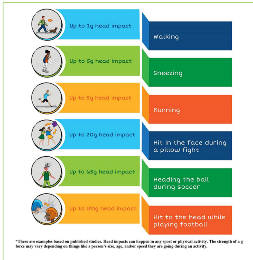
Figure 3. Examples of head impact g forces for different activities*.