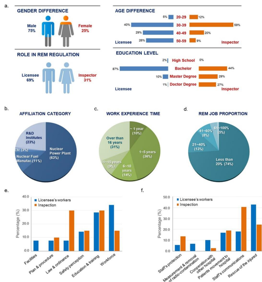
Figure 3. Important factors for safety regulation of radiation emergency medicine. (a) General characteristics of respondents, (b) Distribution of the affiliation types, (c) Distribution of career period (d) Job proportion in REM, (e) Important factors of REM safety regulation, (f) Important factors in the response of REM. REM: regulation of emergency.