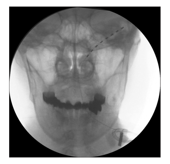
Fig. 1. This fluoroscopic image is an intraoperative fluoroscopic image after the occipital nerve stimulation trial.