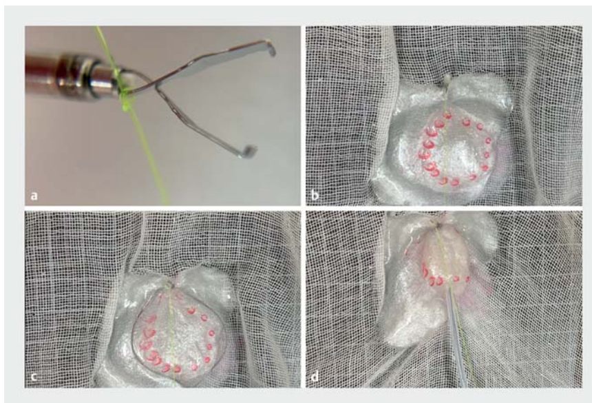
► Fig. 1 Schematic demonstration of clip-line-assisted underwater endoscopic mucosal resection. a Tie a line to the base of the teeth of the clip and insert it through the accessory channel of the endoscope. b Place the clip-line on the anal side at a distance from the lesion. c When the snare expands, pull the line toward the accessory channel and fix the snare tip to the normal mucosa. d Tighten the snare while pushing the sheath of the snare.

Snaring for duodenal adenoma using CLU-EMR is a useful method for fixing the snare tip to the anal normal mucosa.